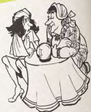
"Who cares about the future — where the hell was I last night?" — A Rabbit Walks Into a Bar