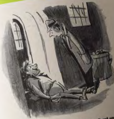
"I'm not powerless over alcohol. I just can't get up." — A Rabbit Walks Into a Bar