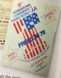
ICYPAA posters through the years.